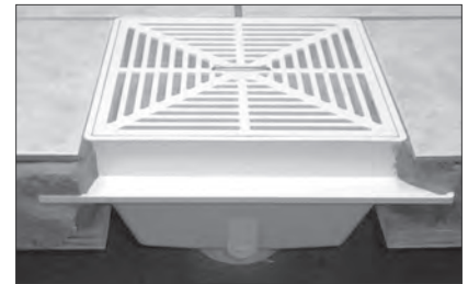
Anchor flange provides solid installations. Thinner rim profile than other square floor sinks.